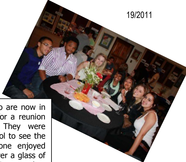
The Gr 7 Class of 2006 who are now in matric came to Beaumont for a reunion on Wednesday evening. They were taken on a tour of the school to see the new developments. Everyone enjoyed chatting to their teachers over a glass of champagne and lots of delicious snacks. In the photo are the Gr 7A class of 2006